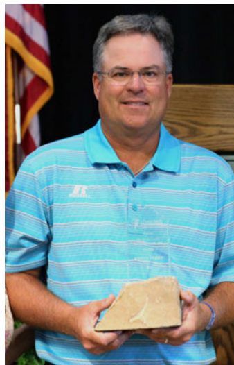
Kenny Perry 2014 Recipient