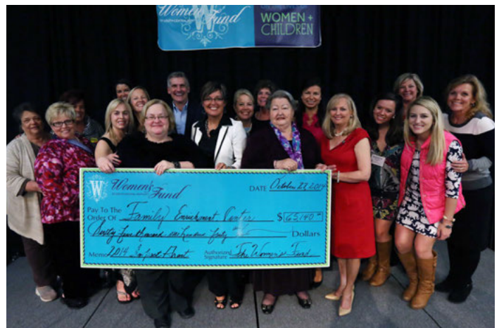
Women's Fund awarded $65,140 Impact Grant to Family Enrichment Center