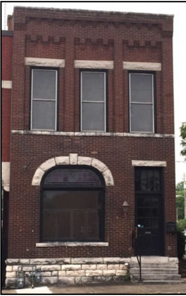
FOUNDATION'S NEW HOME 810 COLLEGE STREET

The primary mission of the Community Foundation is to develop local philanthropic giving by providing the infrastructure to support charitable endowments that will benefit local charities. This is possible because the Community Foundation has made investments to obtain the knowledge, facilities, and technology to provide accounting, asset management, legal and other professional and technical services needed to professionally manage charitable endowments in today's complex regulatory environment.